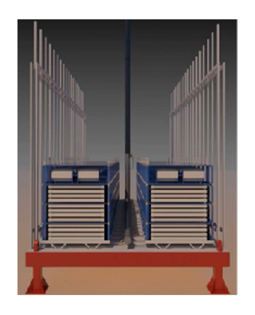
Waterfountain Max up to 200,000 m3 (162 acre foot) / day