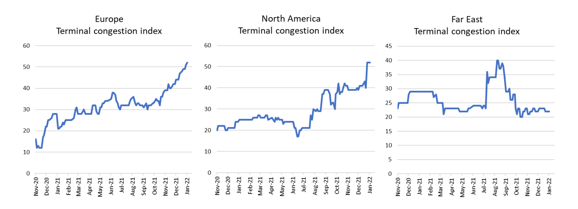
Index based on HMM bi-weekly customer advisories

Congestion leads to effective removal of both vessels and containers from the supply/demand balance globally